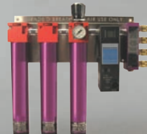
Compressed Air Systems