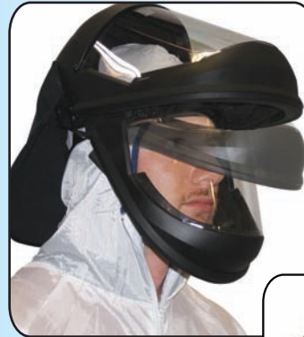
Easy flip-up for visual inspection