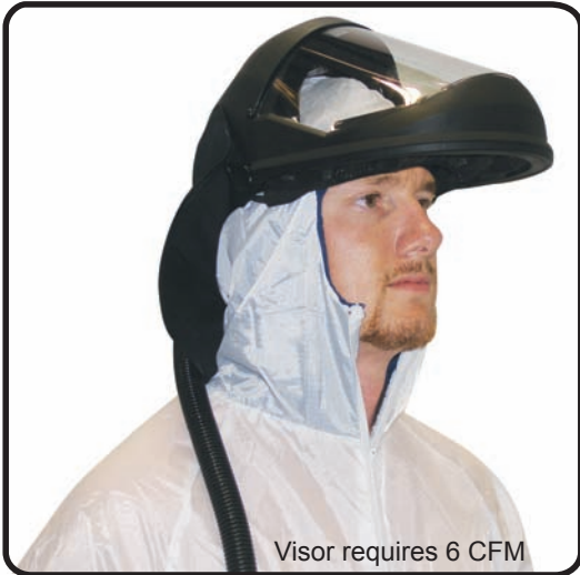
Visor requires 6 CFM