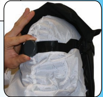
Ratcheting headpiece for a comfortable fit