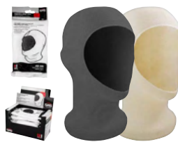
Deluxe Standard Individually packaged for re-sale