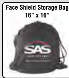
Item No. 5145-20