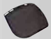
Steel mesh face shield